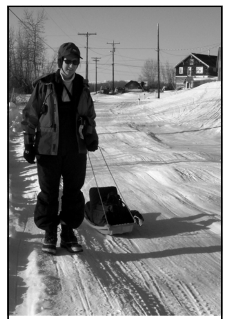
The audio equipment used for field research is delicate and sophisticated albeit heavy. It's much easier for me to transport when there's snow on the ground.

In 2002, I received an award from the National Science Foundation (Arctic Social Sciences Research Program, Office of Polar Programs) for research on "Deg Xinag Lexicon and Grammar" (grant no. OPP 0137483). I am currently concluding year two of this three-year grant. It provides funding